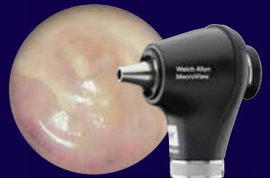
Welch Allyn MacroView® Plus Otoscope